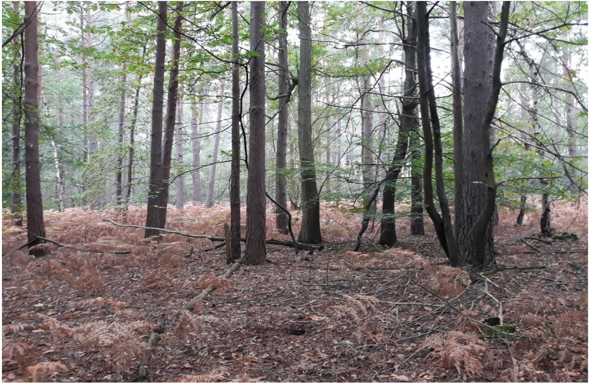
VIEW FROM WITHIN SITE NORTH OF WOODLANDS LANE TOWARDS HEATHPARK DRIVE