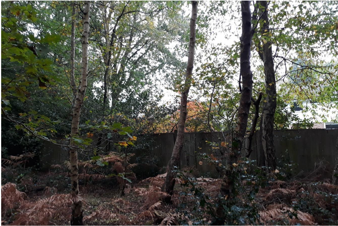
VIEW FROM WITHIN SITE NORTH OF WOODLANDS LANE TOWARDS OAKWOOD