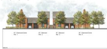
Street Elevation B-B Scale 1:100