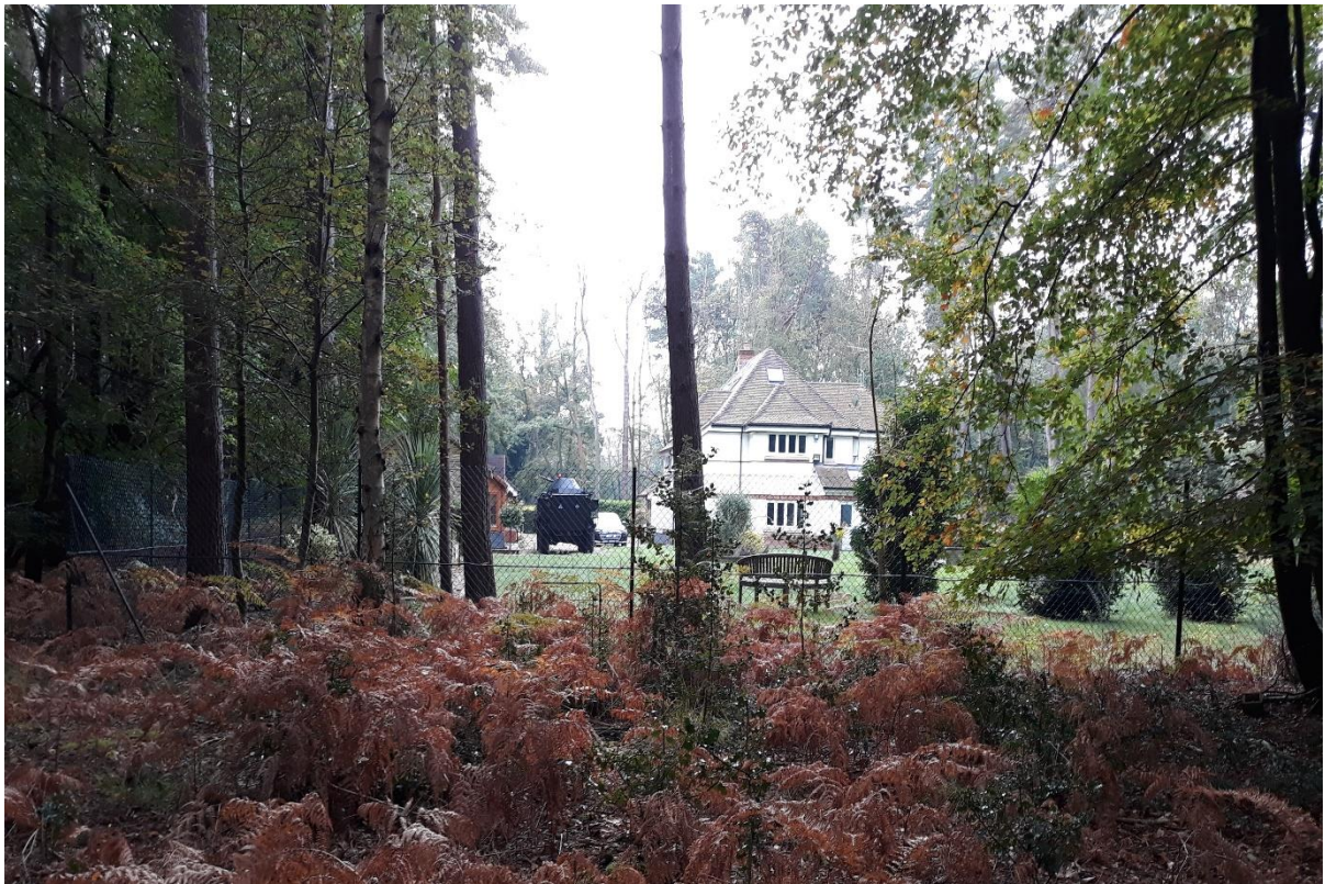
VIEW FROM WITHIN THE SITE NORTH OF WOODLANDS LANE TOWARDS THE FERNS (KILTUBRIDE)