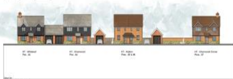
Street Elevation C-C Scale 1:100