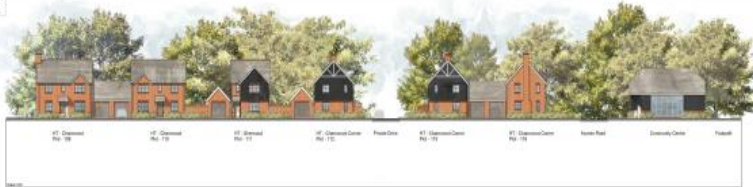
Street Elevation A-A Scale 1:100