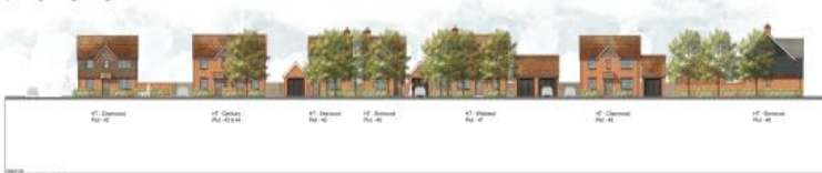
Street Elevation D-D Scale 1:100