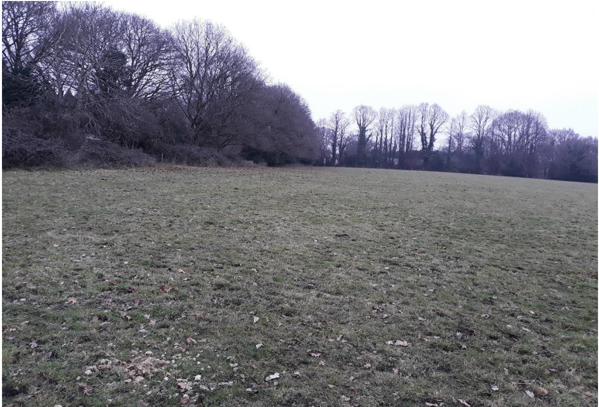
VIEW OF SITE TO SOUTH OF WOODLANDS LANE LOOKING NORTH