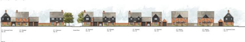
Street Elevation E-E Scale 1:100