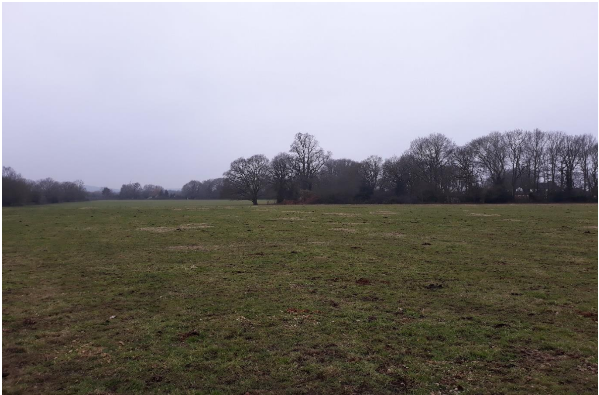
VIEW OF M3 AT SOUTHERN END OF THE SITE TO SOUTH OF WOODLANDS LANE LOOKING SOUTH