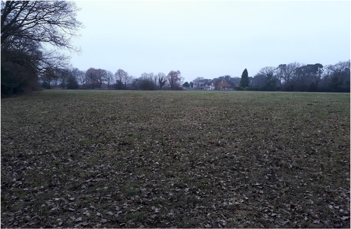
VIEW OF SITE TO SOUTH OF WOODLANDS LANE TO EAST OF SCUTLEY LANE